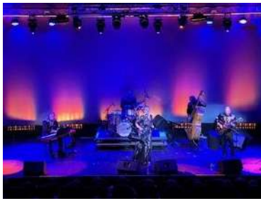
Patsy Cline Tribute Concert