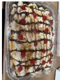
Cooking Club- Chocolate Cake