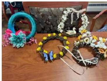
Craft Club- Mini winter Wreath