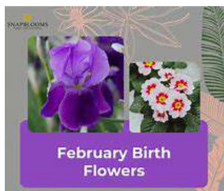
Violet & Primrose

Discover what's going on in our community.