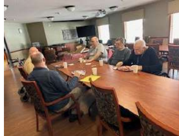
Men's Luncheon- The Legacy Knights