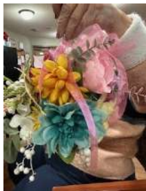
Craft Club- Floral Pomander