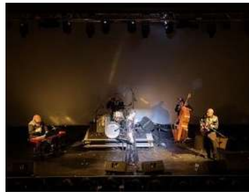
Concert @ Le Musique in St Michael