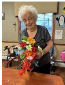
Aggie's Floral Creation