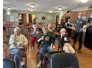
Lifespark Tryathlon- Treats