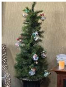
Celebration of Life Tree 12/29/23