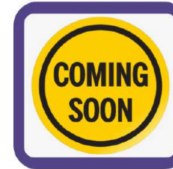
EDIT Coming Soon