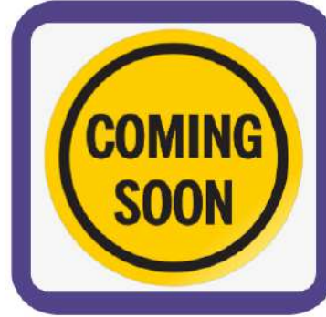
Marketing Director Coming Soon