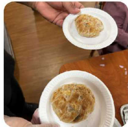
Made Apple fritters at Culinar Chef Demo