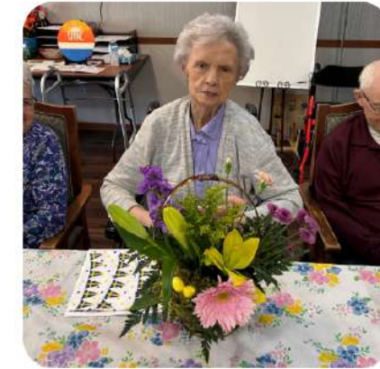
Fika & Flowers came in and we made flower arrangements