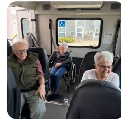
Took a trip to Nothing Bundt Cakes