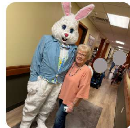
Easter Bunny came for a visit