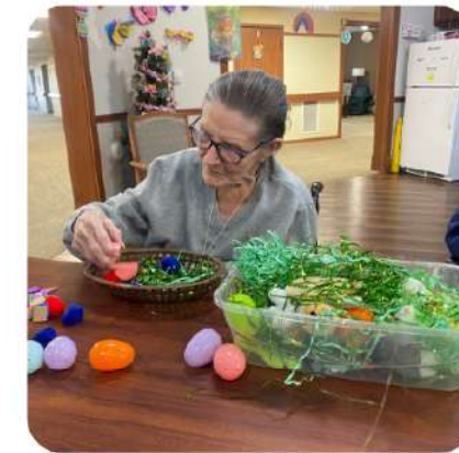
Had some crafting fun