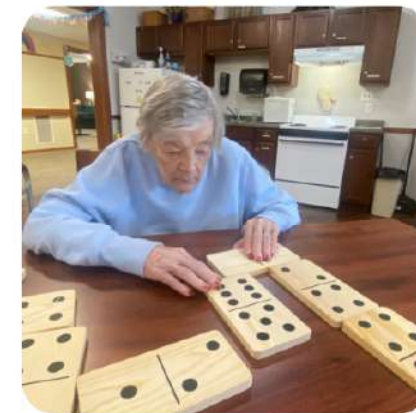
Played some Dominos