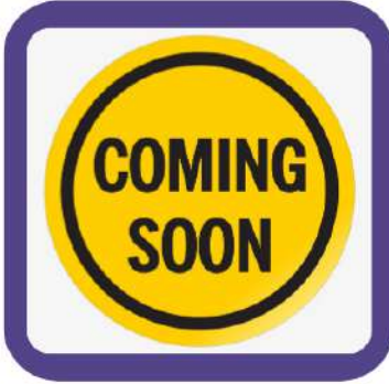
Assistant ED/ Business Office Coming Soon