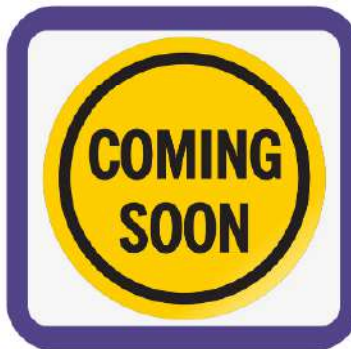
Culinary Director Coming Soon!